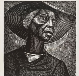
Elizabeth Catlett, "Sharecropper"

Join us on Facebook by searching for AHS Art or you can go to www.facebook.com/pages/AHS-Art/212107215467922 and like our page!