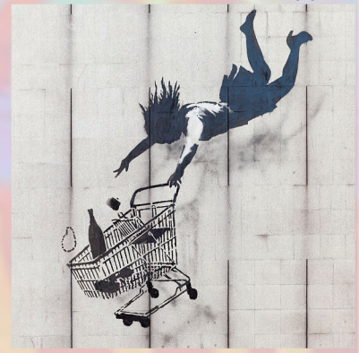
Banksy, "Shop Until You Drop"