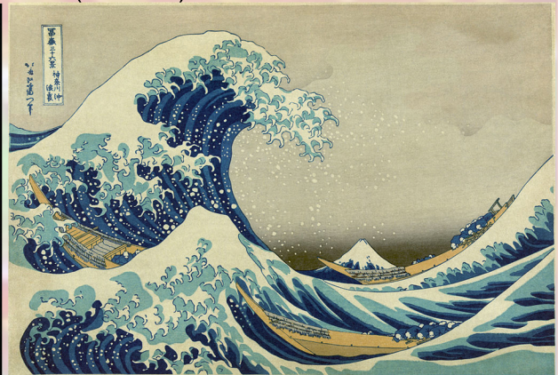
Hokusai, "The Great Wave"