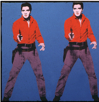
Andy Warhol, "Elvis I & II"