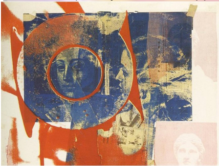
Robert Rauschenberg, Untitled, Instituto Valenciano de Arte Moderno (IVAM)